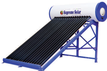
Glassline Solar Water Heater