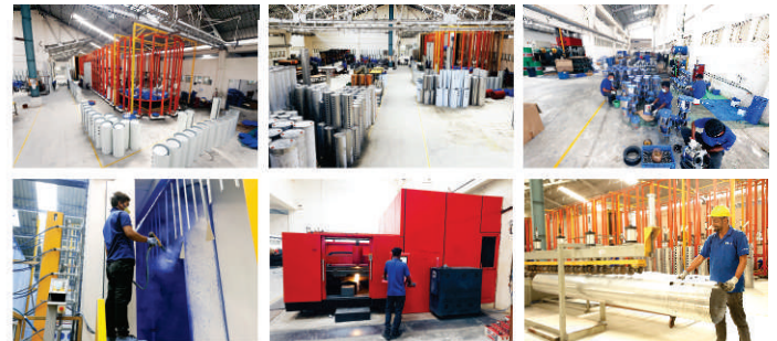
State of Art Manufacturing Plant at Doddaballapur, Bangalore- INDIA