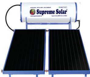
FPC Solar Water Heater