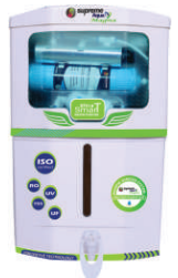
RO Water Purifier